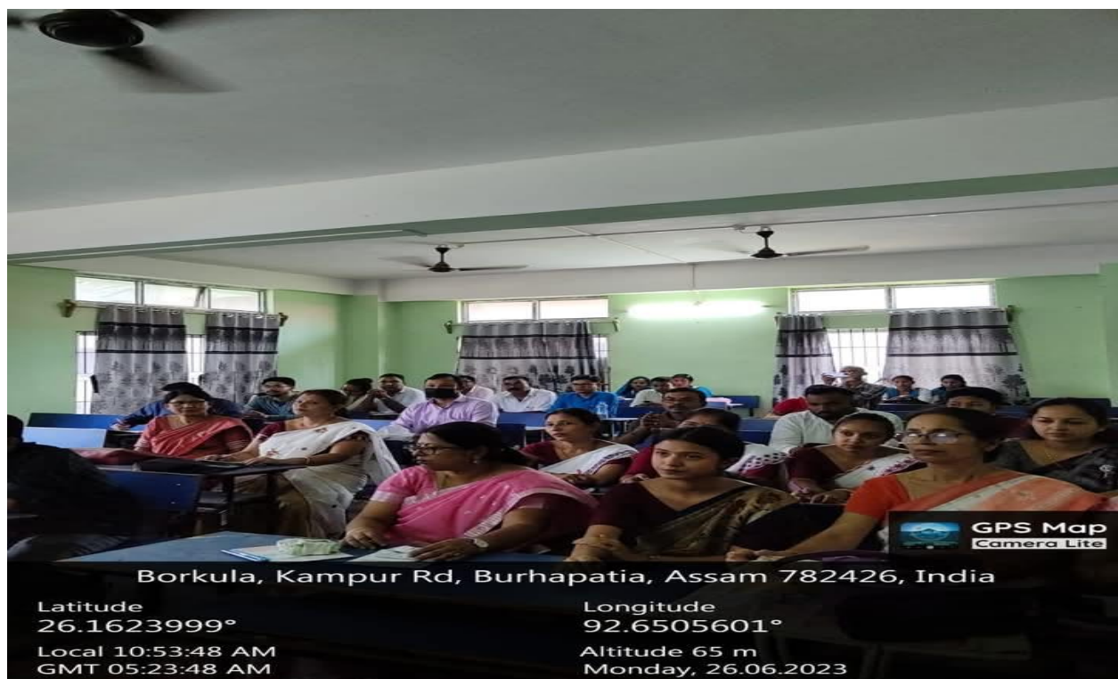
Three days Faculty Development Programme (FDP) organised by IQAC , Kampur College in Collaboration with ICT Academy on 26-06-2023 to 28-06-2023